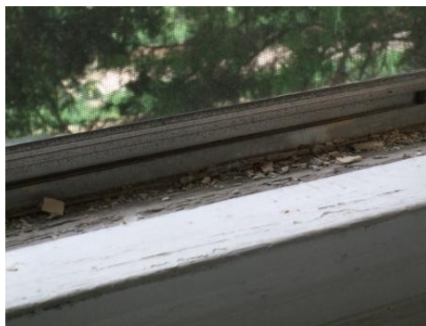
Chipped lead paint on a window

There is a high correlation of lead paint use to single-pane windows, which are typically the least efficient window option. Lead paint was banned in 1977, around the time when double-pane windows became standard. Nearly all pre-1940 homes with single-pane windows and about